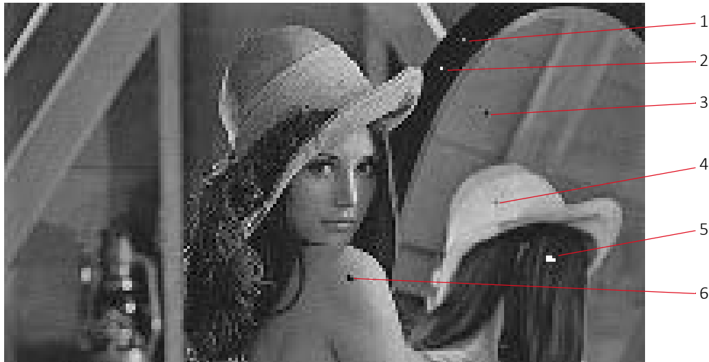
Figure 2: Example image showing various pixel defects

The following example show various pixel defects: