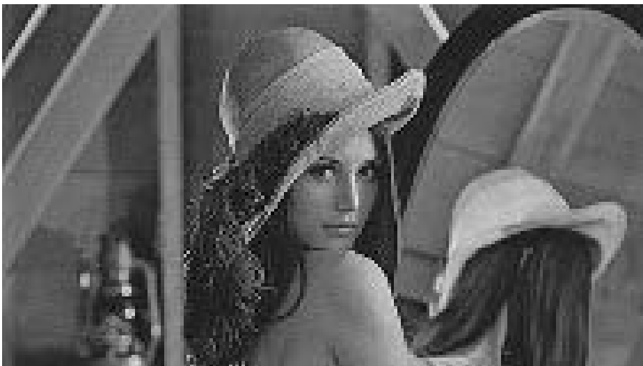
Figure 3: The same image after DPC correction has been applied

The same image after the DPC has been applied is shown below: