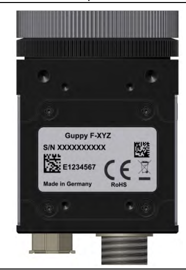
New version (22.5x12.5mm size label)

The change is implemented since 2015-March-12. From this date on, all cameras are produced with the larger label. First serial number with the change: 252366690.